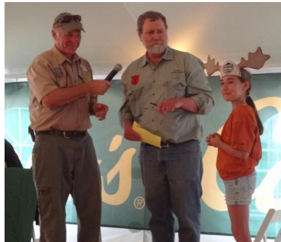
The annual Maine Moose Festival includes a moose calling competition for adults and children 12 and under.

As part of the weekend event, the Axe Women Loggers of Maine, who compete nationally in a wide range of timbersports, will perform wood carving and axe cutting demonstrations. There will be opportunities to win raffles for major prizes, including Cabela's gear, a hand-crafted dog sled, and the opportunity to be part of the Guinness World Records attempt for the most people moose calling simultaneously, which will be held Saturday at 1:45 p.m.