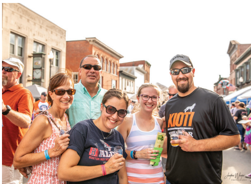
Above: Dog sledding at SnowFest. Below, top: Happy festival-goers at the Skowhegan Craft Brew Fest, Middle: Winning boys' Maple Madness team. Bottom: Holiday Stroll parade