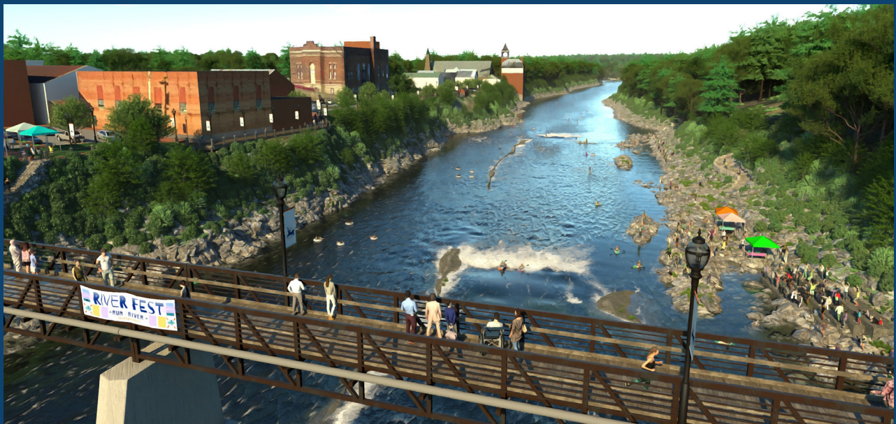
Rendering of the future Skowhegan River Park

This report is part of a comprehensive study that highlights the transformative projected impact, reinforcing the case for significant investment in the region.