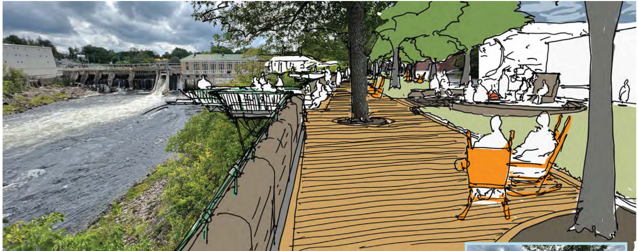
Design concept for the Skowhegan Riverfront Promenade

The 1,000-foot Riverfront Promenade , to be constructed along the downtown riverfront, will include gorge overlooks, river access, and civic spaces for gathering, recreation, and festivals. Connecting the river to the commercial district, the Promenade will serve as essential event and civic infrastructure, enhancing accessibility and fostering economic and social vitality in downtown Skowhegan.